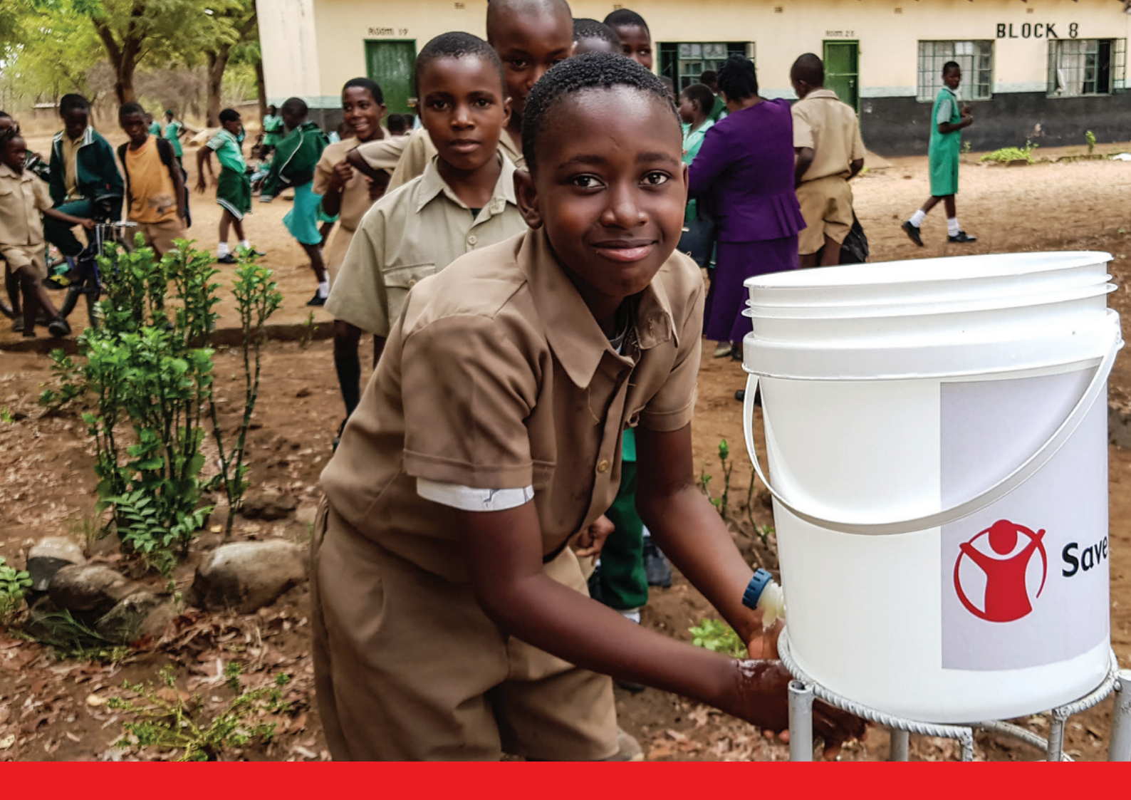
SC Humanitarian WASH Framework – Alignment of Humanitarian WASH with Ambition 2030